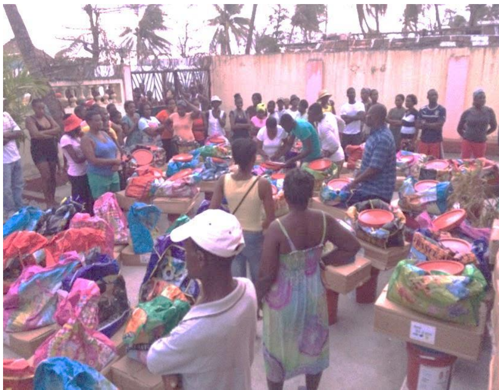
Food distribution in Haiti.

Please support PWRDF's response to this ongoing emergency!